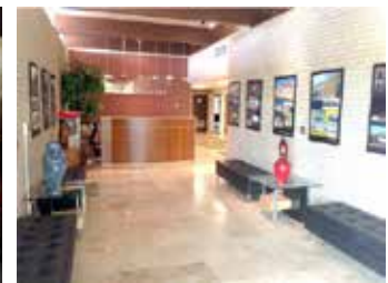
The offices of M3A Architecture, PLLC.

depending on the type of project. The maximum amount for eligible manufacturing projects is $5,500,000.