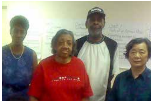
May 2014 CDSMP class at Azalea Christian Manor

The CDSMP was developed by a team of Stanford Uni-